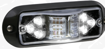
White Steady-Burn Flood/Alley