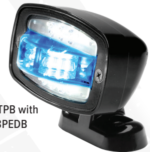
V23BTPB with V23PEDB