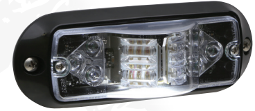
White Ground Illumination