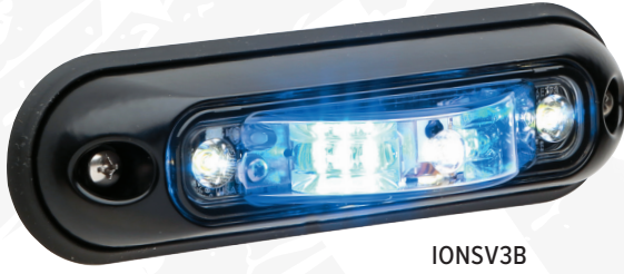
IONSV3B Surface Mount