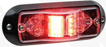
SAE 845 Class 1, 180° Warning

Featuring Whelen's innovative optic technology, V-Series Super-LED® lighthoods are versatile and efficient. Utilizing multiple planes of light in one lighthood, models are available in a variety of sizes for use in numerous applications. Hard-coated lenses resist environmental damage from sand, sun, salt, and road chemicals.