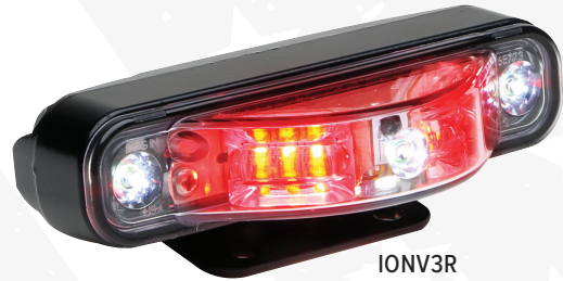
IONV3R Universal Mount