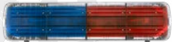
9XENDB (1) 9XDCNTB (1) 9XENDR (1) 9XDCNTR (1)