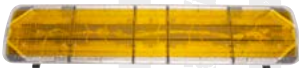
9XENDA (2) 9XDCNTA (2) 9XSCNTA (1)