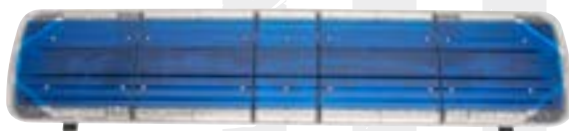
9XENDB (2) 9XDCNTB (2) 9XSCNTB (1)