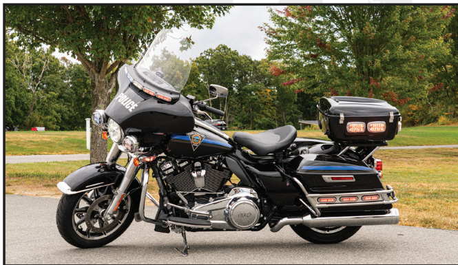
Motorcycle shown with additional lighting not included in the Motorcycle Box.