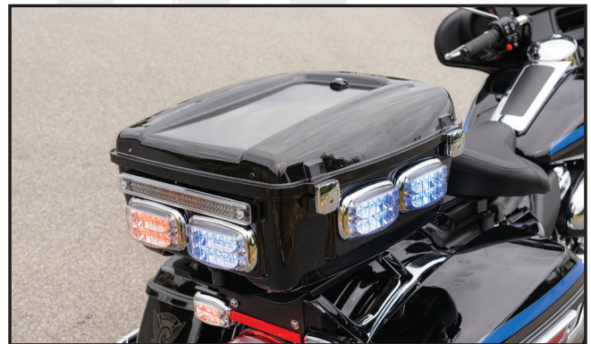
M4B6LR + M4DJ (6) + MBADPT14