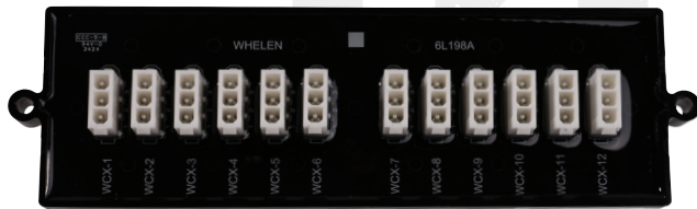
WCX Junction Box