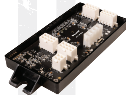
CEM24 Side View