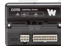
Core Control Point

Control point works with user supplied switches.